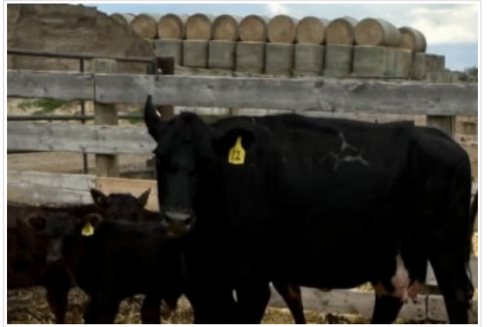
#2 Eastfield Farms