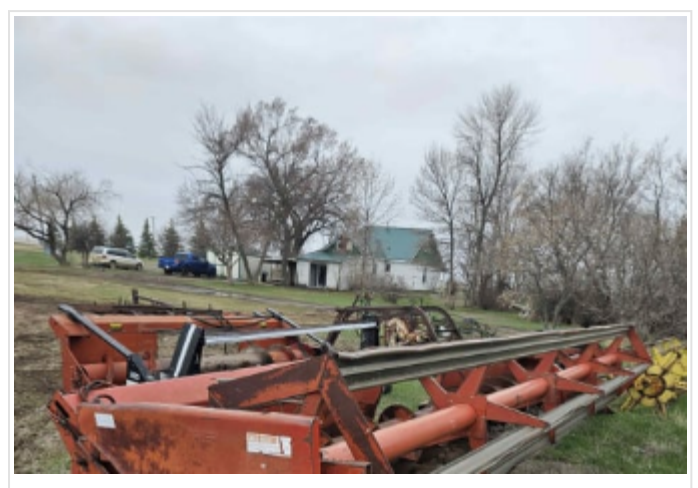
#HTA Case IH Header