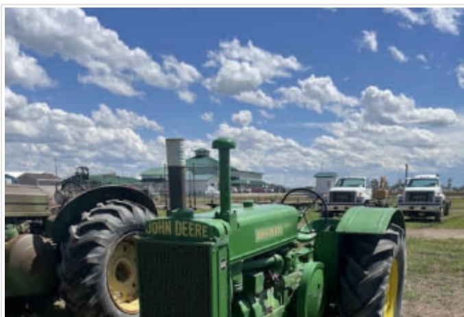
#4915B John Deere AR Unstyled