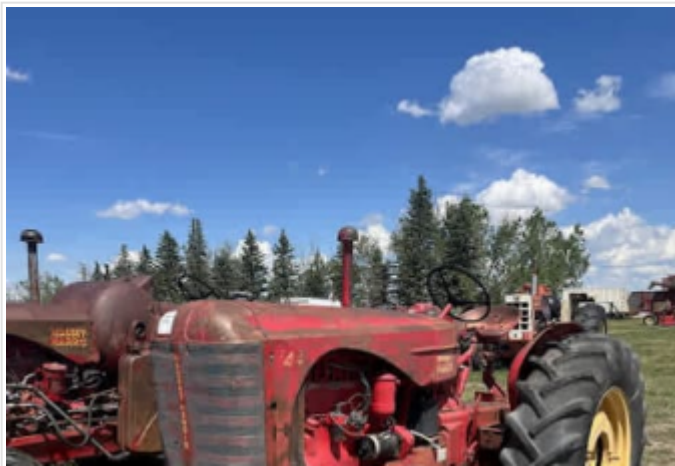
#4900G Massey Harris 44