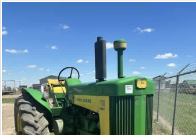
#4915K John Deere 730