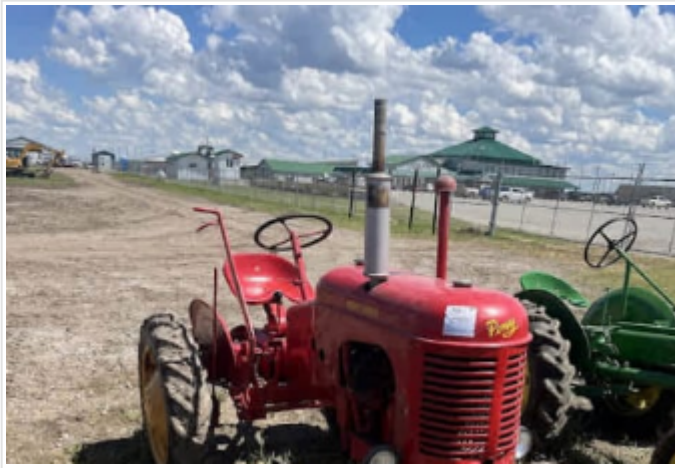
#4915T Massey Harris Pony