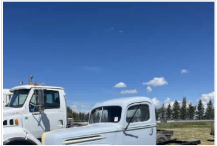
#49000 Military Ford 4x4