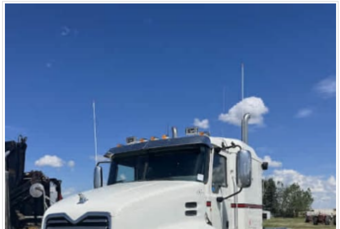
#4915Y Unit #135-13