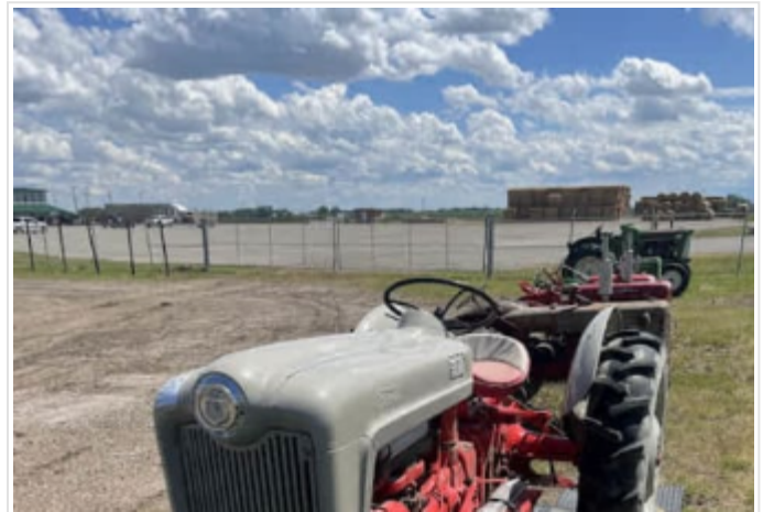
#4900R 1953 Golden Jubilee Model NAA