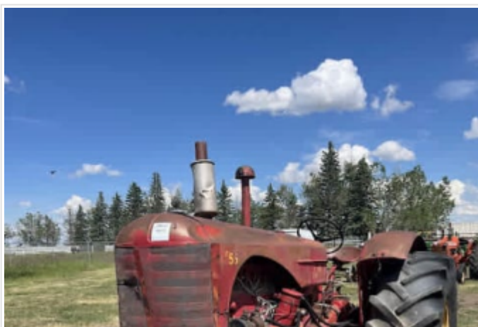
#4900H Massey Harris 55