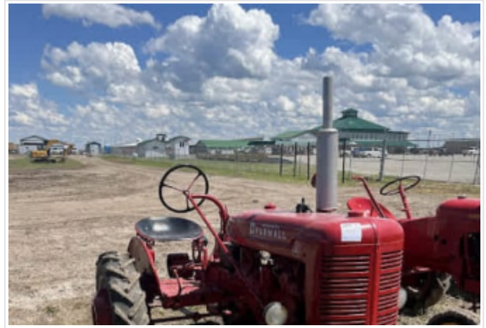
#4915S IH Farmall A