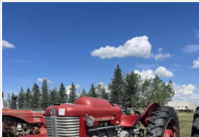
#4900X Massey Ferguson 65