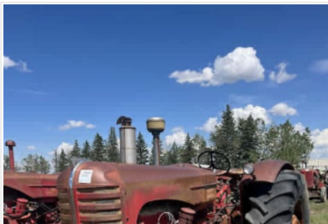
#4900K Massey Harris 55