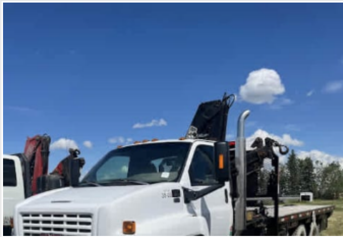
#4900M Unit 35-09