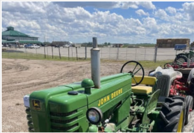
#4900S John Deere M