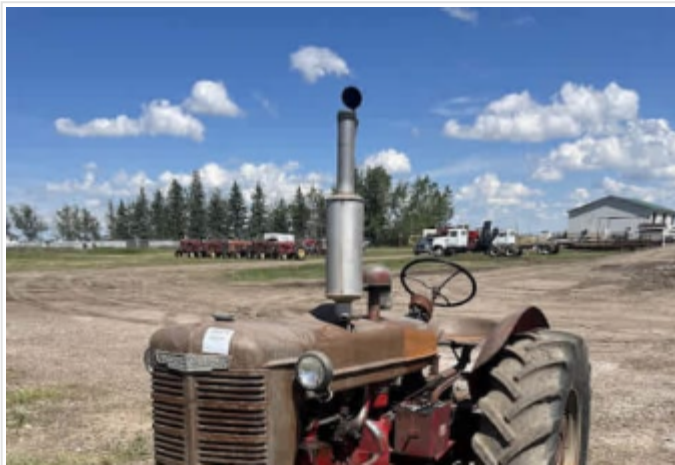
#4915Q IH W4