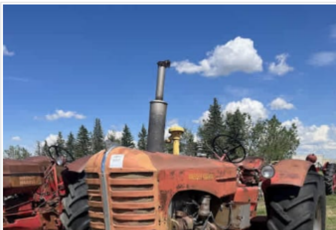
#4900J Massey Harris 444