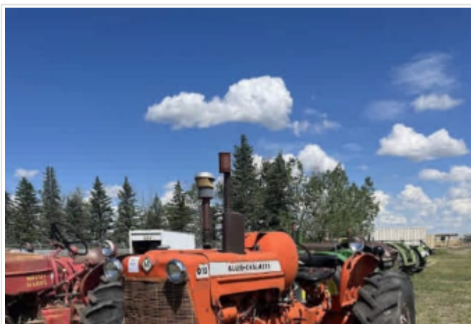
#4900E Allis Chalmers D15 RC