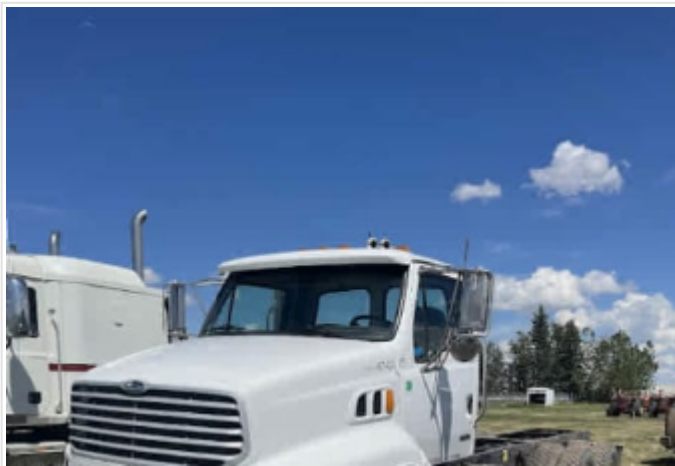
#4915X Unit #67-03