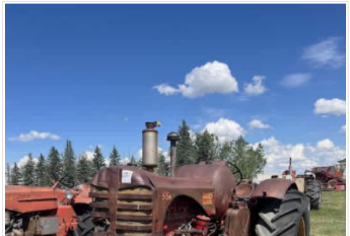
#4900I Massey Harris 55