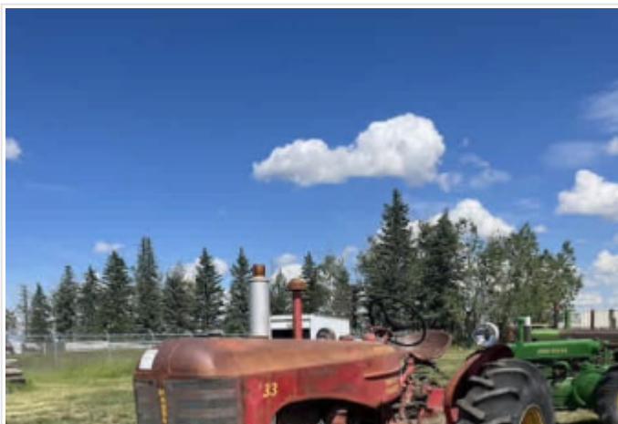
#4900W Massey Harris 33