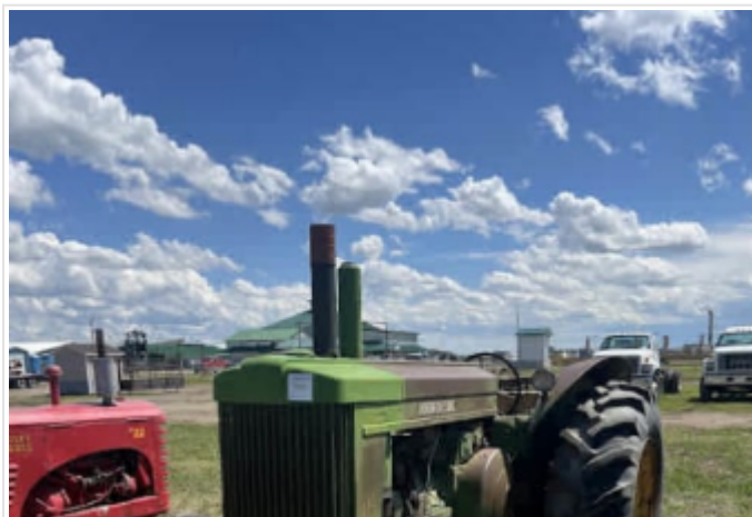
#4915E John Deere 60