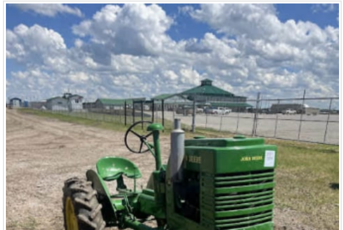
#4915N John Deere LA