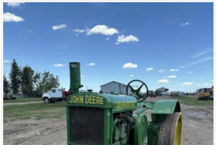
#4423B 1929 JD-GP Tractor