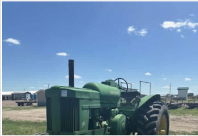
#4915H John Deere 70