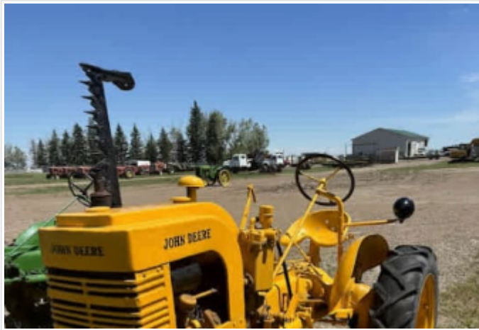
#4423B 1940 JD-LI Industrial Tractor