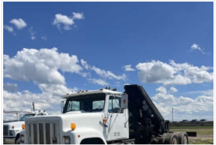
#4900C Unit #88