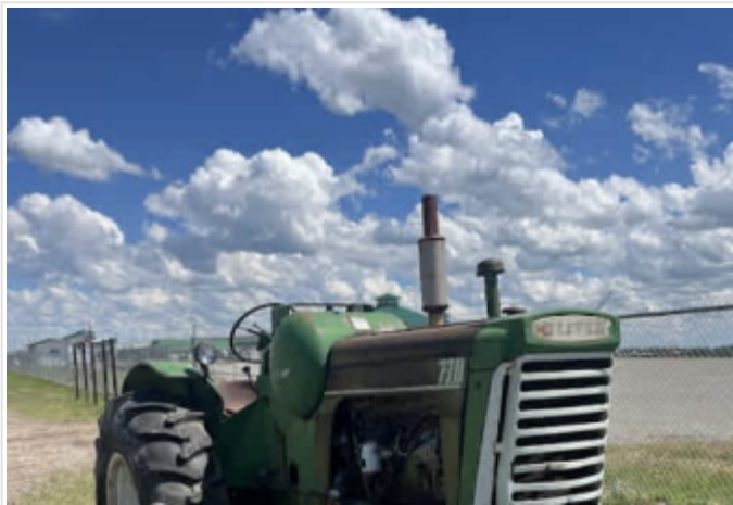
#4900F Oliver 770 LPG