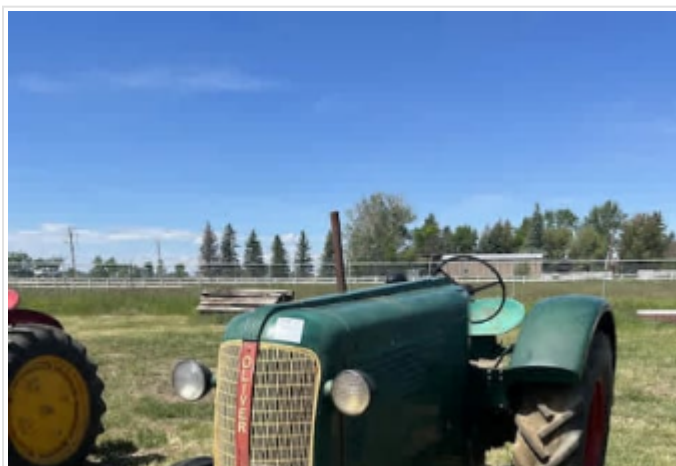
#4900Z Oliver 70