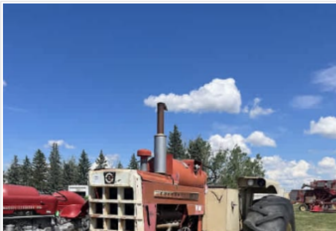
#4900L Cockshutt 1850 LPG