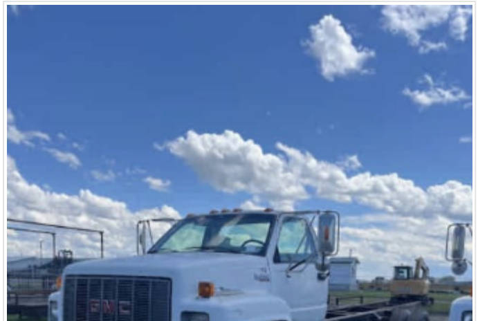
#4900B Unit #62 1994 GMC