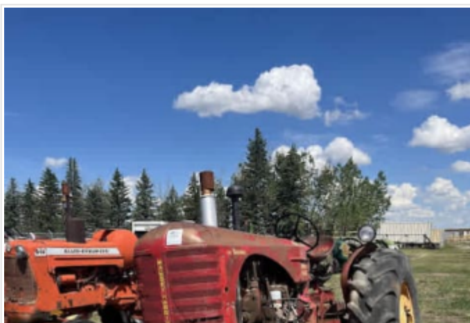
#4900V Massey Harris 44