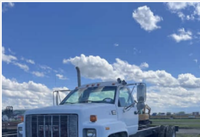
#4900A Unit #33