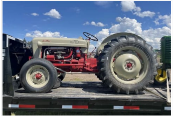
#4900Q 1953 Golden Jubilee Model NAA