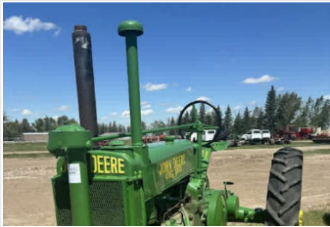
#4423C JD Model A Tractor