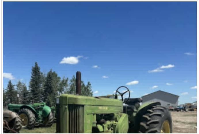
#4915I John Deere 70