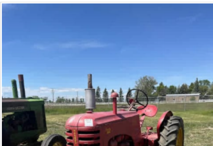
#4915R Massey Harris 22