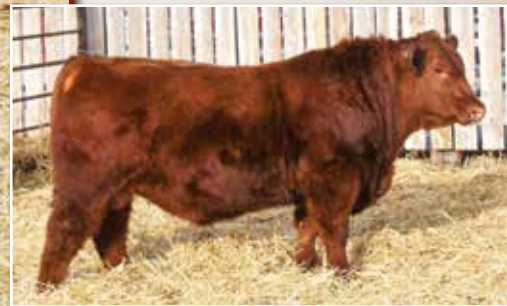
Maternal Brother: DUG 41K

Here is a herd bull prospect. Soft in his makeup, extended through his front end with plenty of style and performance. Big Shot 9L comes out of a young, hard-working cow that has produced a true sale feature for the second year in a row. Here is an attractive complete bull.