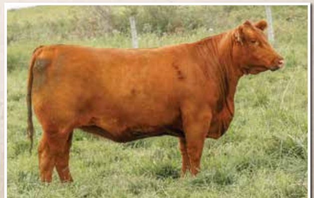
Maternal Sister: DUG 22K

We really admired Red Duralta 167 Momentum 11H and were very excited to AI a select group of cows to him after purchasing 10 straws of semen out of Red Roundup. This Momentum calf has surpassed all expectations. 8L has been a standout from day one, was easy to pick out all summer on grass, and has continued to be a favorite in the bull pen. Here is a bull built for performance with an October weaning weight of 1160. A true herd bull prospect.