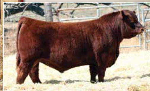
Sire: Mossy Oak

Red Six Mile Mossy Oak was a new addition to our AI program and his calves have done everything we hoped for. Mossy Oak is a unique combination of superior phenotype and body design with breed-leading calving ease and growth. Here is no exception to the Mossy Oak legacy and out of a hard working young Itza female. This calf is safe to use on heifers and will add performance and growth.