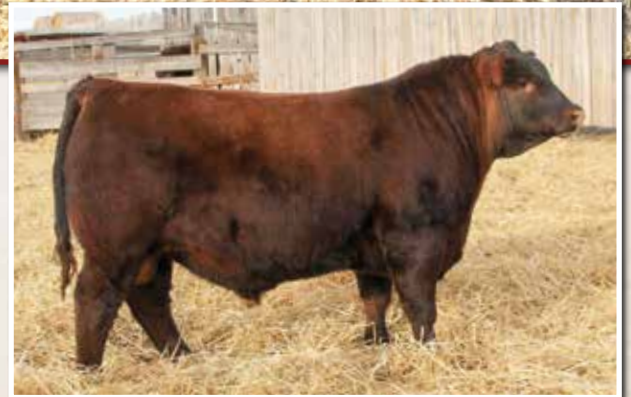
Maternal Brother: DUG 13K