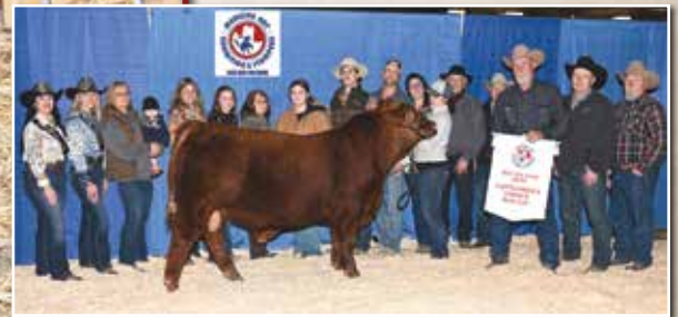
Medicine Hat Beef Pen Show Cattleman's Choice Bull Calf:

Another stout-made performance bull with extra hip and muscle shape. Out of a Red CD Dynamite daughter showing in the top 4% and 3% for breed average weaning and yearling weights. The Dynamite sire was a bull that had a proven ability to produce calves with a extra grow and shape.