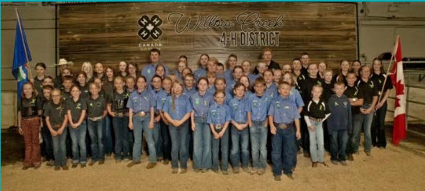
2025 Achievement Day