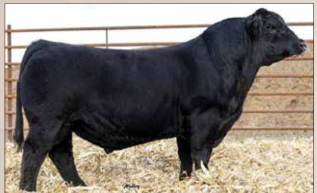
OMF EPIC E27 - Sire of Lot 58