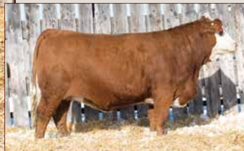
JKL MISS JENNIFER 34J - Dam of Lot 41