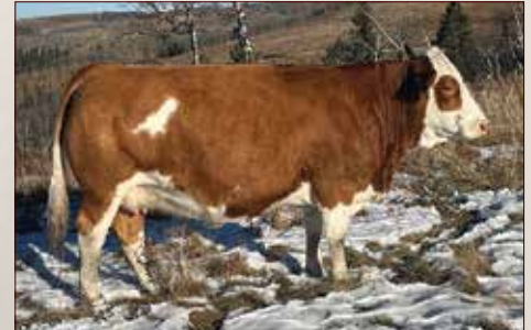
PAR ASPEN 627D - Dam of Lot 80

100% Fleckvieh Polled, easy moving and smooth made. Anchored by a powerful Dam from the well known MRLN Anna cow family.