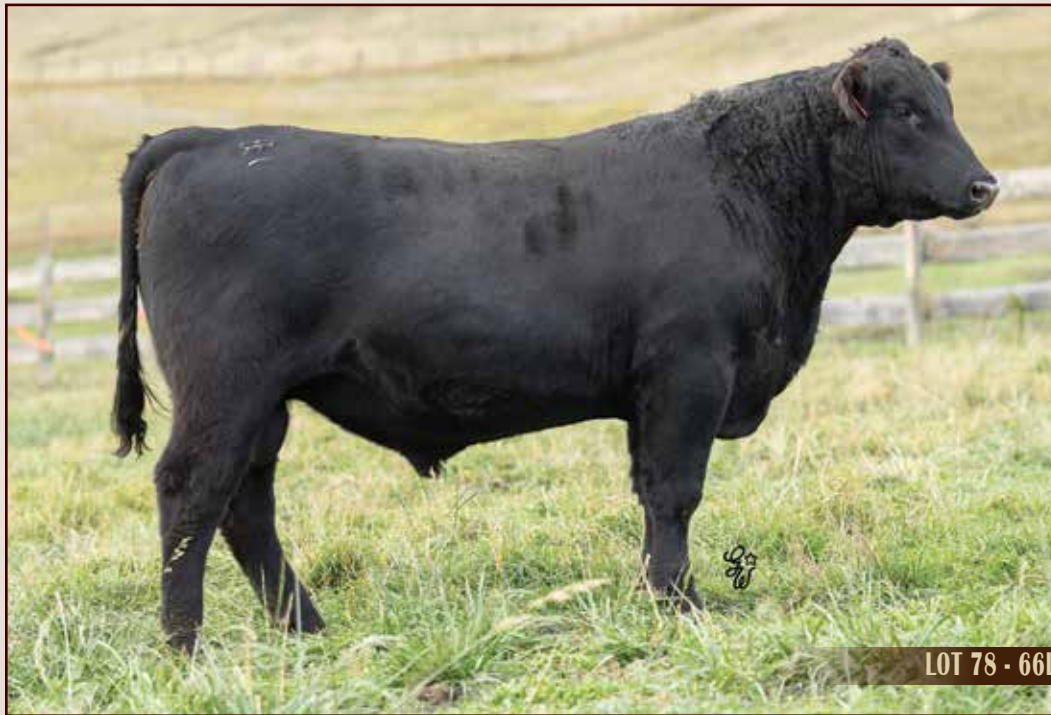
LOT 78 - 66L