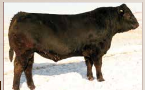
R & R BEEFMAKER 116D - Sire of Lot 74