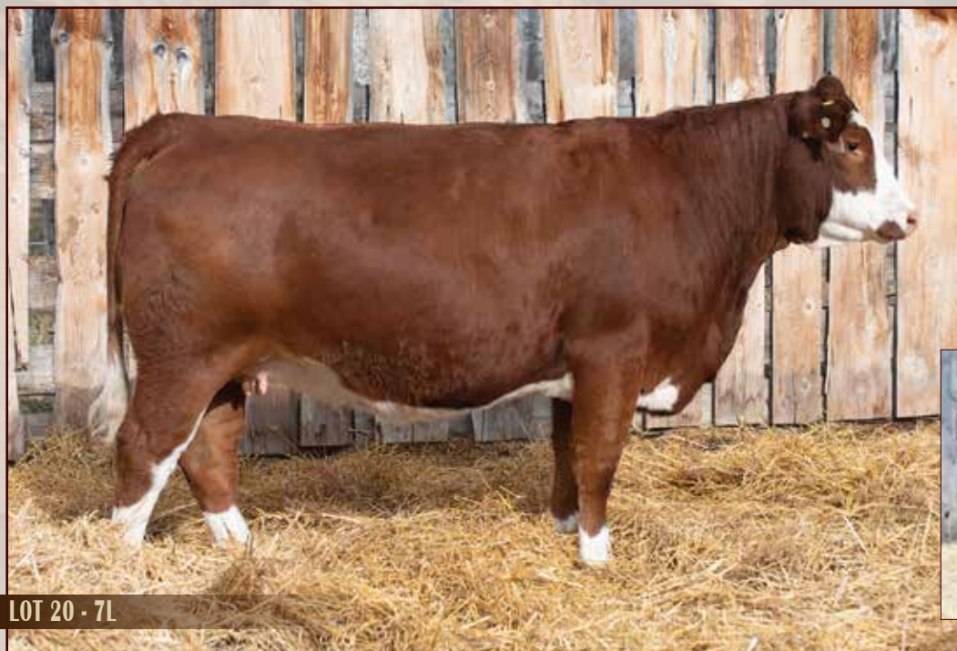
LOT 20 - 7L

MTV GALT 9N MVS AVA 1G MVS VIXEN 2E GIDSCO APPOLLO 3F BEL NORA 308C SILVER LAKE LAGACY MVS MARIE