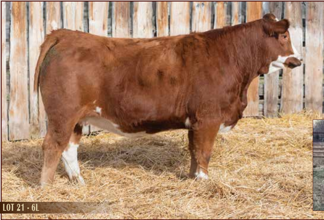
LOT 21 - 6L