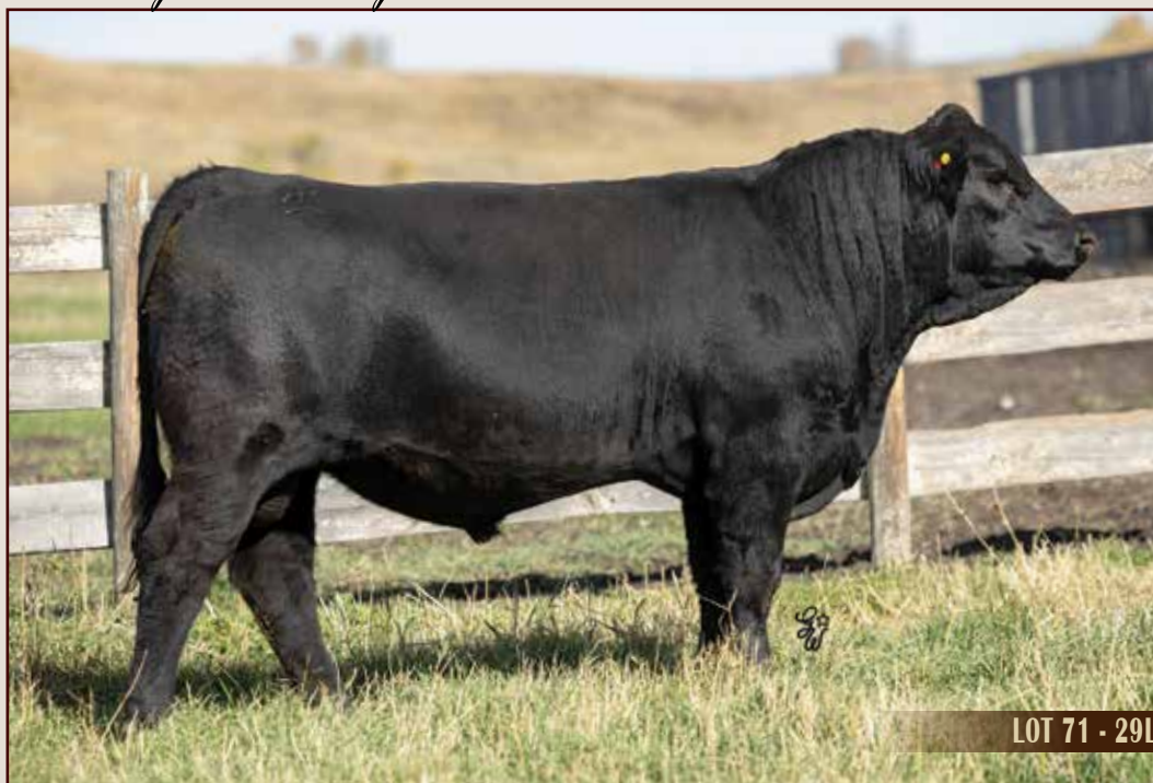
LOT 71 - 29L