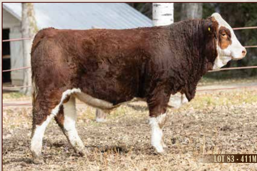
LOT 83 - 411M

100% Fleckvieh Polled, attractive Skulled and performance, all round out this bull. He also stems from the MRLN Anna cow family on his bottom side.