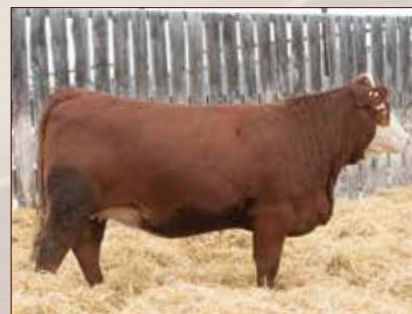
JKL MISS KAREN 20K - Maternal Sister of Lot 2