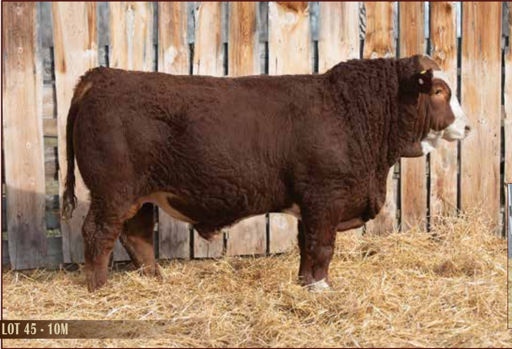
LOT 45 - 10M