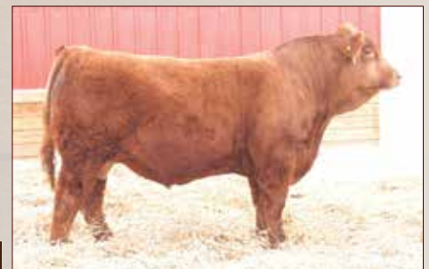
TRAXS RUSHMORE X103 - Sire of Lot 70