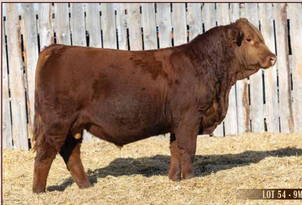
LOT 54 - 9M