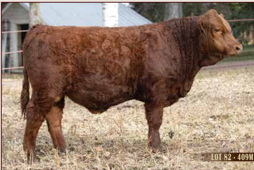
LOT 82 - 409M

A red purebred with a little different pedigree, Sired by CCRS American Ice and out of a very productive female from our Bar 15 Snowflake line.