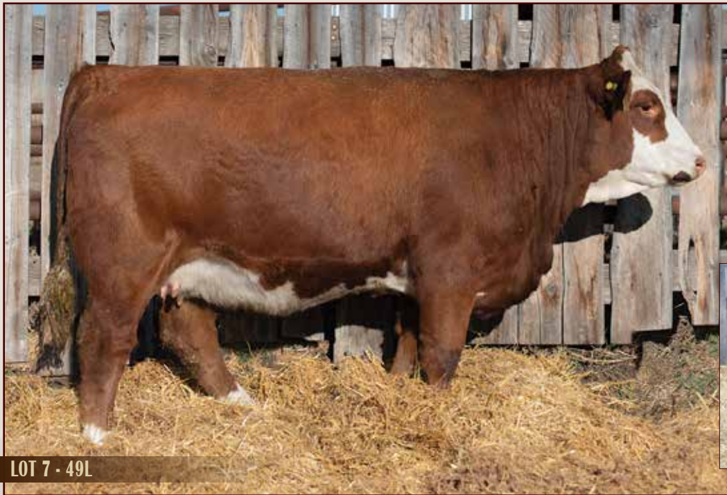
LOT 7 - 49L