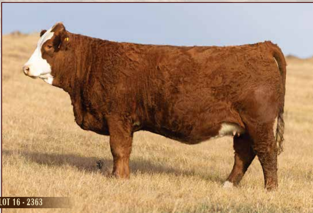
LOT 16 - 2363