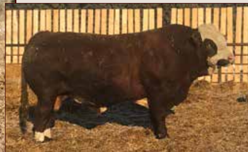
BEE BATTLE CRY 282B - Service Sire of Lots 3 and 10

AI bred to BEE Battle Cry 282B (#1135464) on March 27, 2024. Exposed to MJB Lucas 24L (#1440767) April 14 - June 1, 2024. Pregnant to AI date.