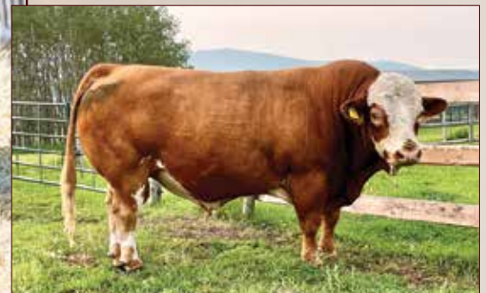
MTV CORVIAR 6B at nine years of age - Sire of Lot 85 and 86

This black blaze faced bull is very well put together and thick throughout. He was our heaviest at weaning and his dam Rendezvous Shamwow 44A always weans the good ones! He will also be the last bull calf out of our late herd sire MTV 6B.