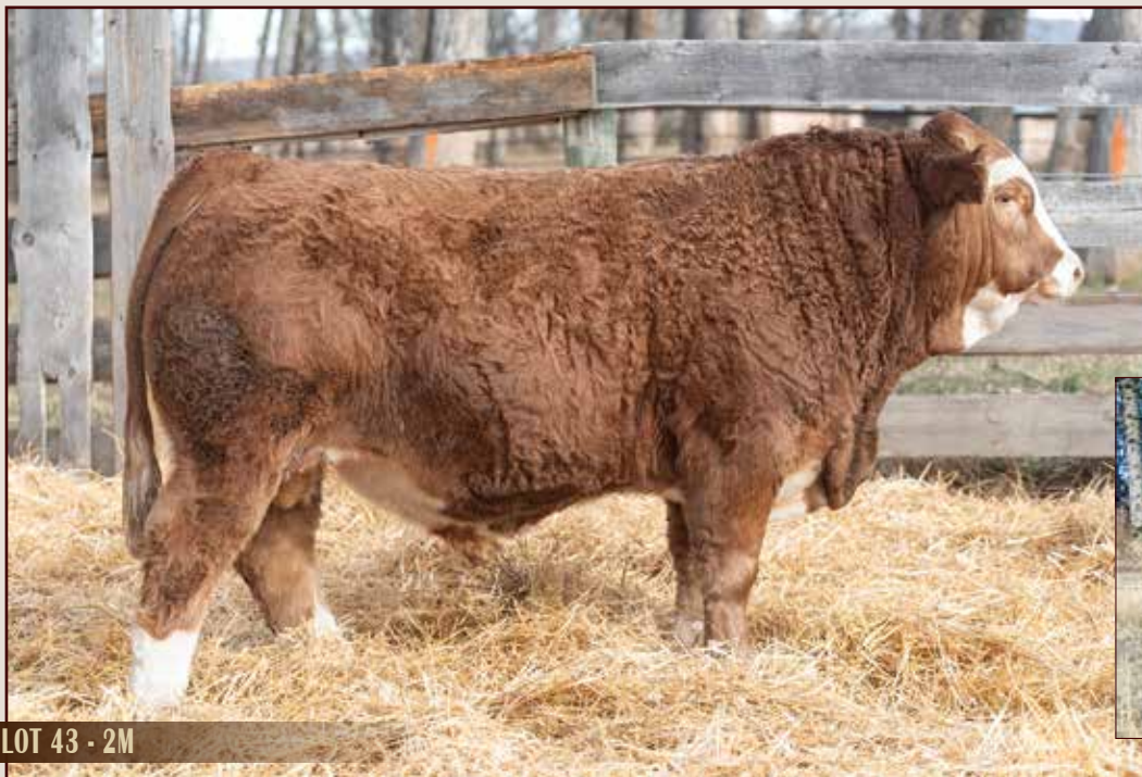
LOT 43 - 2M