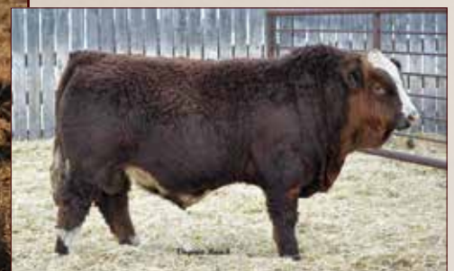
VIRGINIA DIRTY-HANDS 723J - Sire of Lot 8

AI bred to Virginia Radisson 5Z (#773557) on March 27, 2024. Exposed to MJB 24L (#1440767) April 30 to June 1, 2024. Pregnant to AI date.