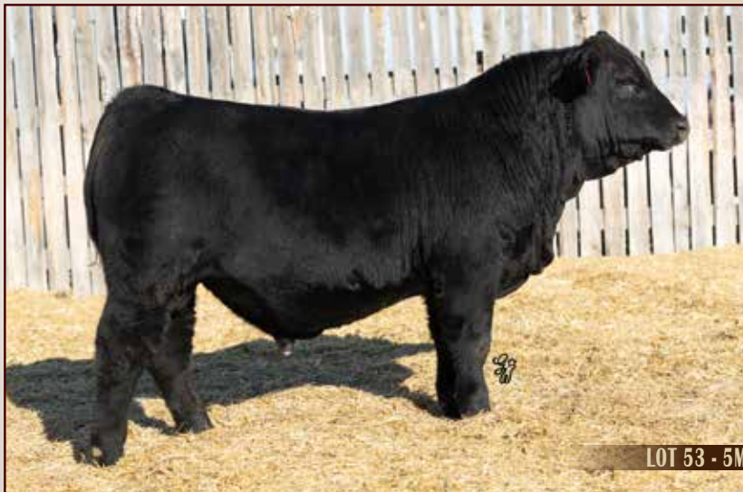
LOT 53 - 5M

Matrix 5M is a bull that brings a pile of performance to the table. Another Caliber son that is a big soft middled bull with a big top carrying down into a powerful hip. To say that Caliber has worked well for us is an understatement. Out of a no miss cow for us that brought a bull to the 2023 round up sale and has multiple other progeny working across AB. 5M was our highest performing bull at weaning time and has not skipped a beat since. Look to this powerhouse to really add some extra pounds at weaning and will sire some very high capacity replacement females. Be sure to find this bulls video or better yet come see him in person to really appreciate what he has to offer.