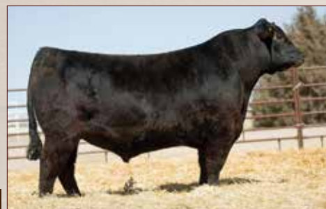
POSS DEADWOOD - Sire of Lot 77