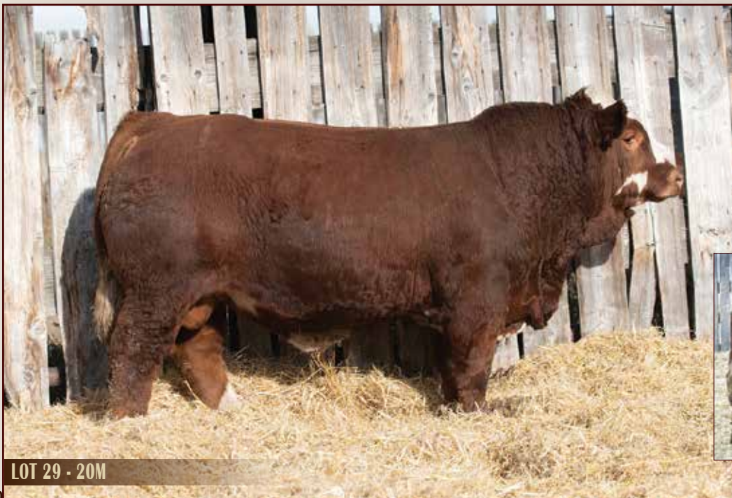
LOT 29 - 20M