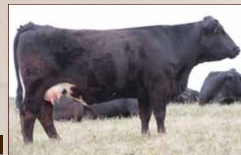
R AND R MILKMAID SMTR 30D - Dam of Lot 62