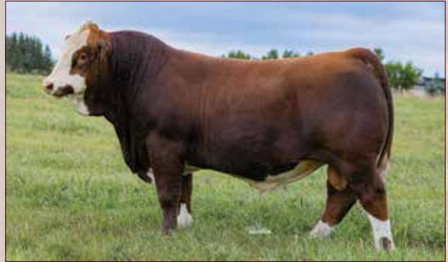
JB CDN BLACKFOOT CROSSING 2332 - Maternal grandson of JB CDN FIESTA 1491