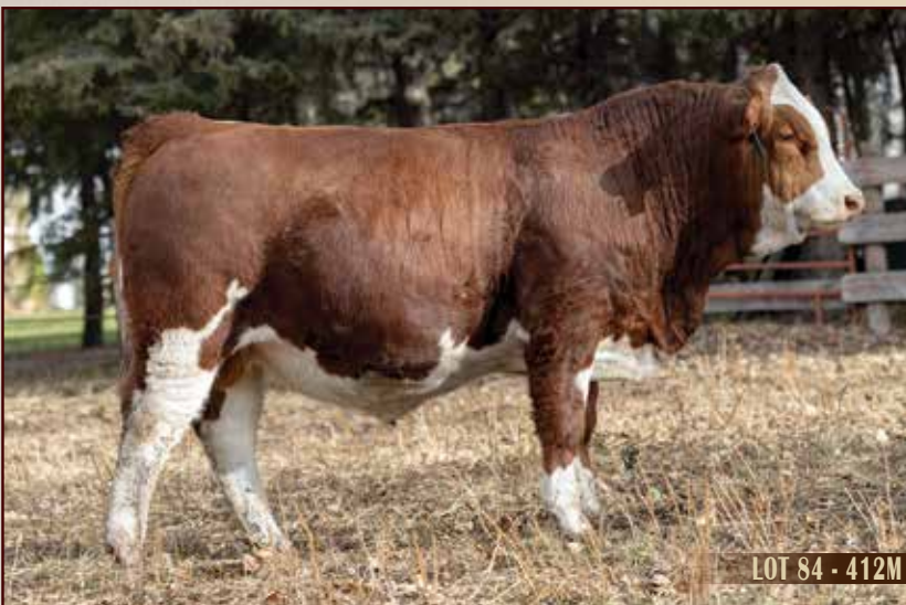
LOT 84 - 412M

100% Fleckvieh Another attractive son of American Ice. Polled with the power to perform. His productive dam is anchored by the Brock Samara cow line.