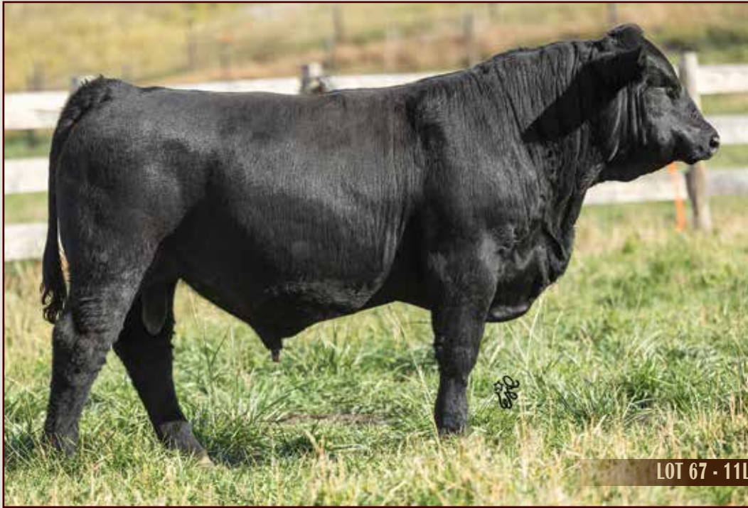
LOT 67 - 11L