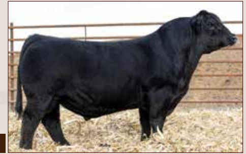
OMF EPIC E27 - Sire of Lot 59