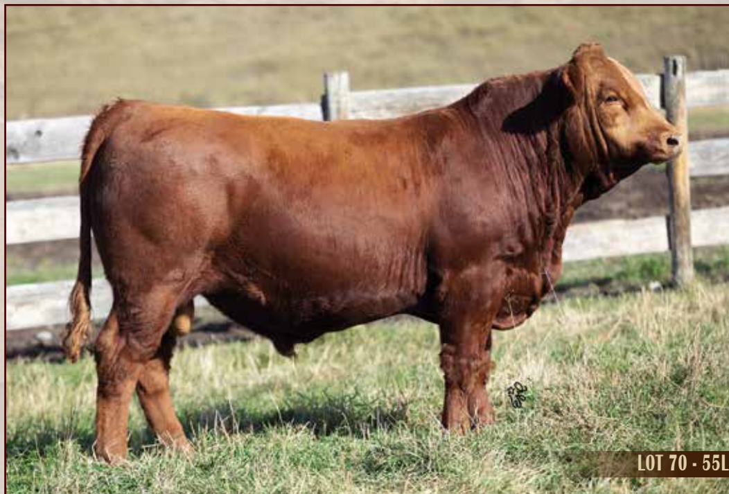
LOT 70 - 55L

BH TRACKER 998J SAFN MISS ZING 02H LCHMN BRIGHT LIGHT L122L R549 HOOKS SHEAR FORCE 38K DCR MS RIBEYE N72 WULFS XTRACTOR X233X R&R MILKMAID 143R