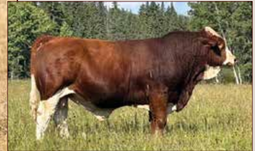
PAR CONSTANTINE 304L - Exposure Sire of Lots 23 and 24

Exposed May 1 to June 15 to PAR Constantine 304L P1454454