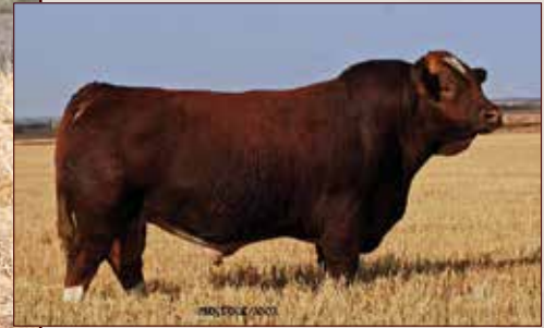
RUGGED R CAVILL - Sire of Lots 17 and 19

Observed bred to MTV Maurey 5L on April 25th. Ultrasound safe to April 25th breeding on June 9th. Exposed to MTV Maurey 5L from April 15- June 15.