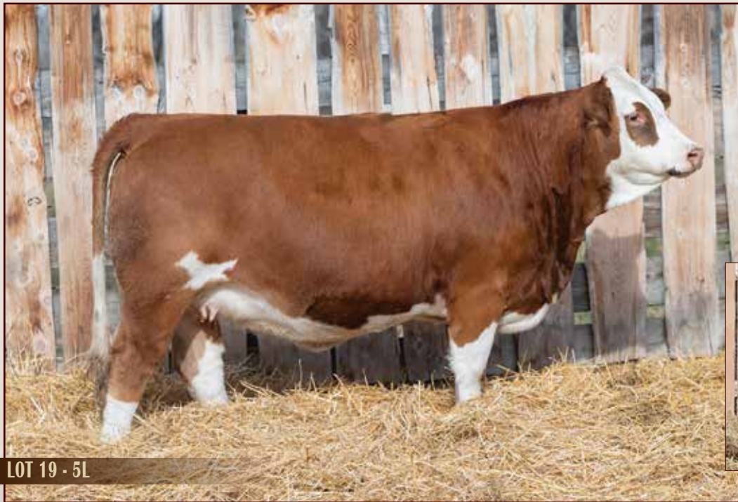
LOT 19 - 5L