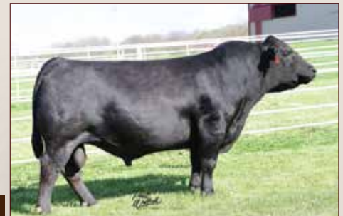
WS PROCLAMATION E202 - Sire of Lots 65 and 66