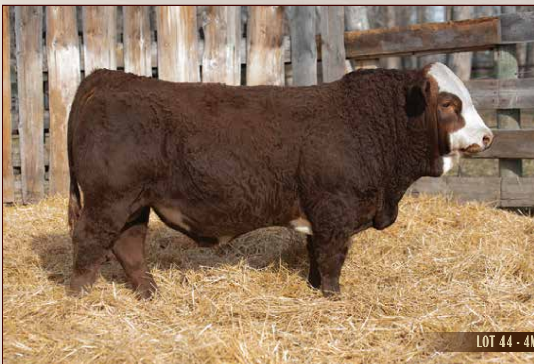
LOT 44 - 4M

VIRGINIA WALKER 97W SIBELLE GOLDA SILVER LAKE LAGACY MTV TAMMY 3A SIBELLE VICKING 35B VIRGINIA MS SUZIE VIRGINIA KENT 1X MTV BELLE 1J