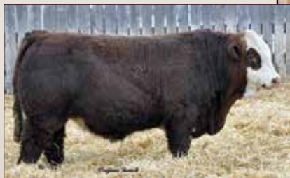
VIRGINIA FULL-TILT 530J Sire of Lots 30 and 33

MJB 1M is a Virginia Full Tilt 530J son out of a Virginia Blue Chip 85E daughter. Montgomery's grand sire is Crossroad Radium 9U. Montgomery is structurally sound with good testicular development. He is bred for calving ease. Actual WW (31 Aug 2024) 730 pounds. WWADJ 703 pounds.