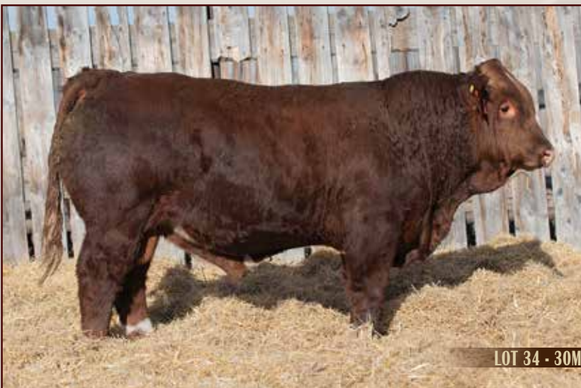
LOT 34 - 30M

Montana is a dark red solid colored with a small star on his forehead with an excellent top and thick butt. He has solid red front legs to his hooves and red hind legs to below his fetlocks. He is by Virginia Dirty-Hands 723J. This Sibelle Pol Synergy grandson is out of a moderate sized Imax daughter. Actual WW (31 Aug 2024) 790 pounds. WWADJ 748 pounds.