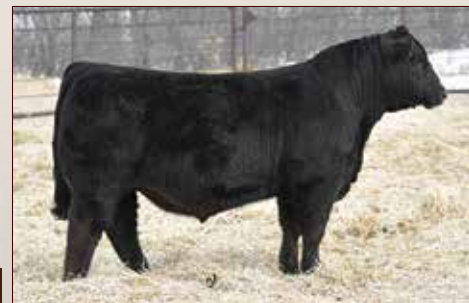
LCDR FAVOR 149F - Sire of Lots 61 and 62