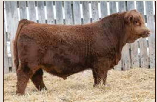
IPU 1G POTENT 17K - Sire of Lot 25

When choosing heifers to consign to this sale, we were drawn to this heifer for her moderate frame, deep body, smoothness and style. She is such a sweet docile girl. Her dam is a solid young cow that has raised 3 other calves, 2 bulls, both sold to Gordon Turner Farms Ltd, and 1 heifer that was retained in herd. We purchased her sire in the LaBette sale in 2023. His first set of calves have really been impressive. Mostly all heifer calves, with both calving ease and explosive growth.