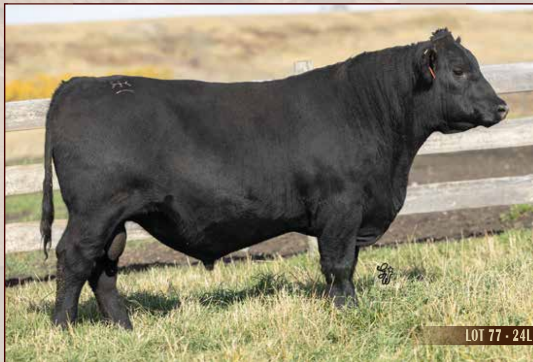
LOT 77 - 24L