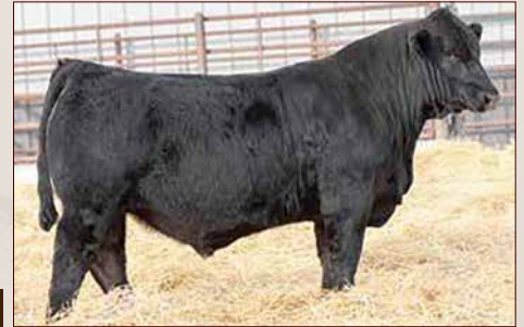
CLRS GUARDIAN 317G - Sire of Lot 67