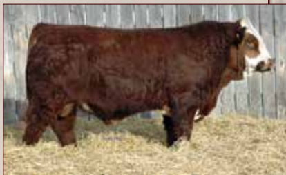
VIRGINIA RADISON 5Z - Sire of Lot 32

Mojo 9M is a solid, colored, structurally sound Virginia Radisson SZ son with a deep body and good feet and legs. Actual WW (31 Aug 2024) 805 pounds. WWADJ 787 pounds.