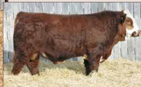
VIRGINIA RADISON 5Z - Service Sire of Lots 5 and 8

AI bred to Virginia Radison 5Z (#773557) on March 27, 2024. Exposed to MJB Lucas 24L (#1440767) April 14 - June 1, 2024. Estimated pregnant to the March 27, 2024 breeding date.