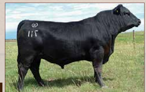
BENCHMARK TENDER BEEF 11'17 - Sire of Lot 79