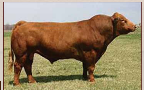
WS BEEF MAKER R13 - Sire of Lot 68