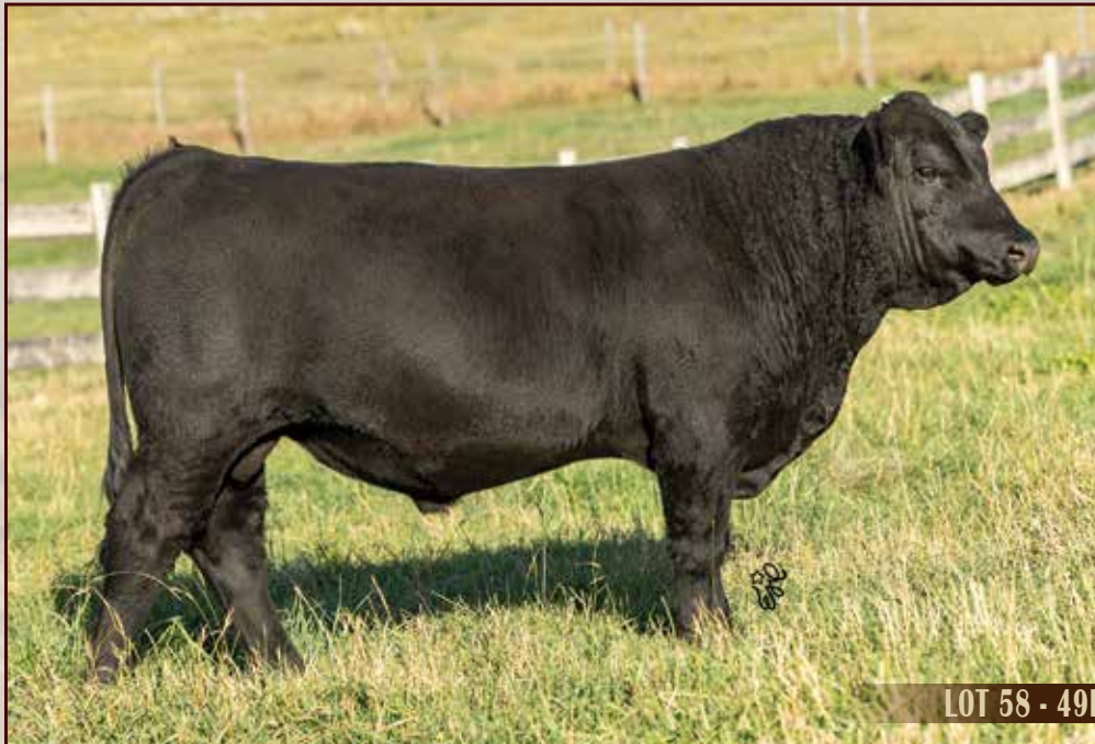
LOT 58 - 49L

Brenda & Brekell Otto 120- 32011 354 Ave W Foothills, AB T1S 7A1 Brenda Cell: 403-818-3142 Brekell Cell: 403-312-9799 Email: BOtto@trranch.ca