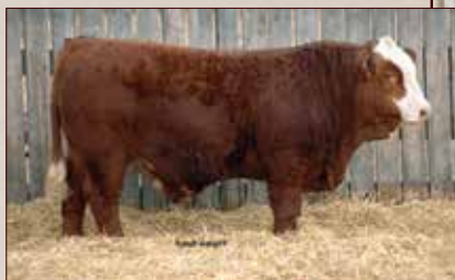
VIRGINIA BEEZER 21F - Sire of Lots 35 and 37

Manhattan is a structurally sound Virginia Beezer 21F son out of a Virginia Blue Chip dam. He is dark red with large goggles a good rump and a flat top. He has good scrotal development. Actual WW (31 Aug 2024) 870 pounds. WWADJ 834 pounds.