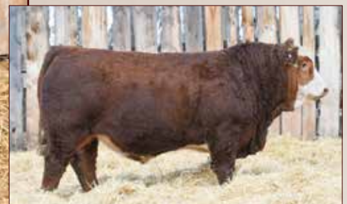
MTV KARLSBURG 3J - Sire of Lots 20 and 21

AI'd to the homo polled CrossRoad Pilot 21H on April 6th. Ultrasound safe to AI on June 9th. Exposed to MTV Maurey 5L April 15th-June 15th.