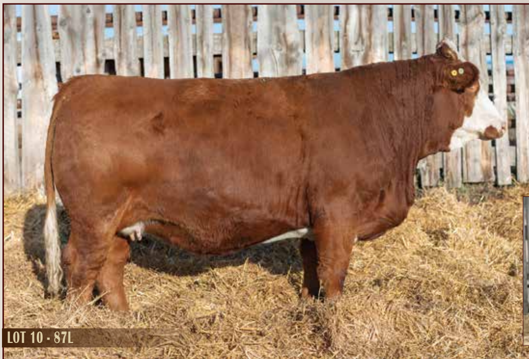
LOT 10 - 87L