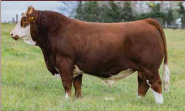
JB CDN SOUTHERN HALO 2305 - Paternal grandson of JB CDN FIESTA 1491