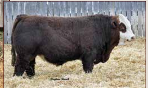
VIRGINIA FULL-TILT 530J - Sire of Lot 7, Service Sire of Lot 4

AI bred to MTV Garrett 5N (#622241). Exposed to MJB Lucas 24L (#1440767) April 12 - June 1, 2024. Pregnant to AI date.