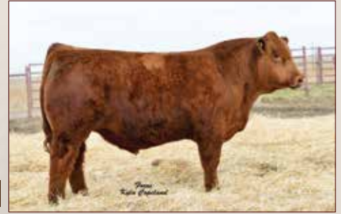
WS ALL ABOARD B80 - Sire of Lot 69