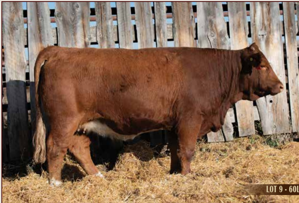
LOT 9 - 60L