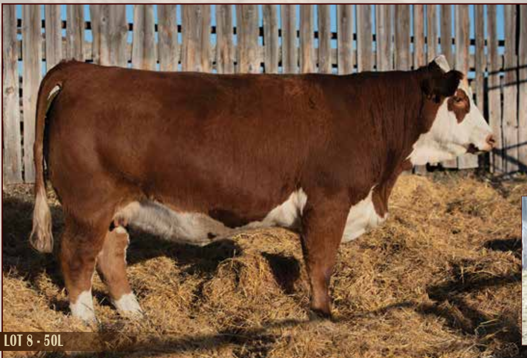
LOT 8 - 50L

SIBELLE SPARTACUS 8A SIBELLE POL CROCUS 20D DOUBLE BAR D BANKER VIRGINIA ABBY 302A CHAMPS ROMANO VIRGINIA'S MS WEST PATTY JB DOCTOR DUKE 442D BEL LA HELGA 301H