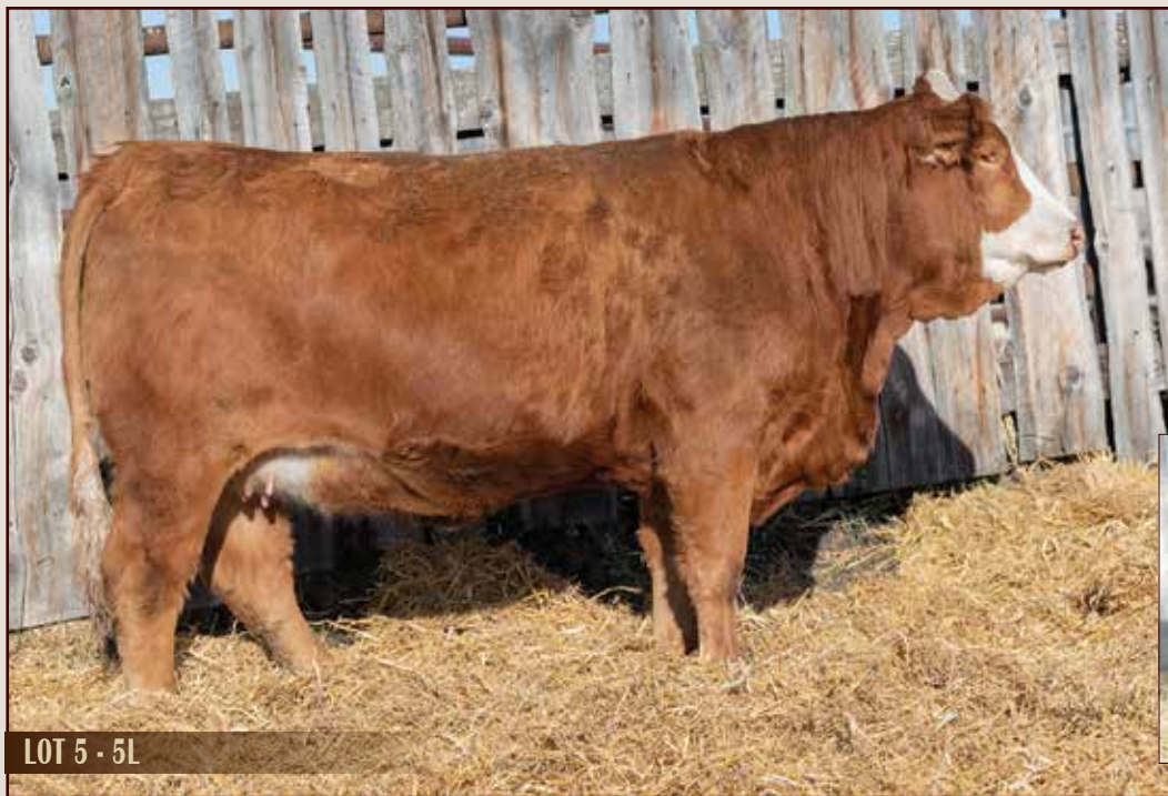
LOT 5 - 5L