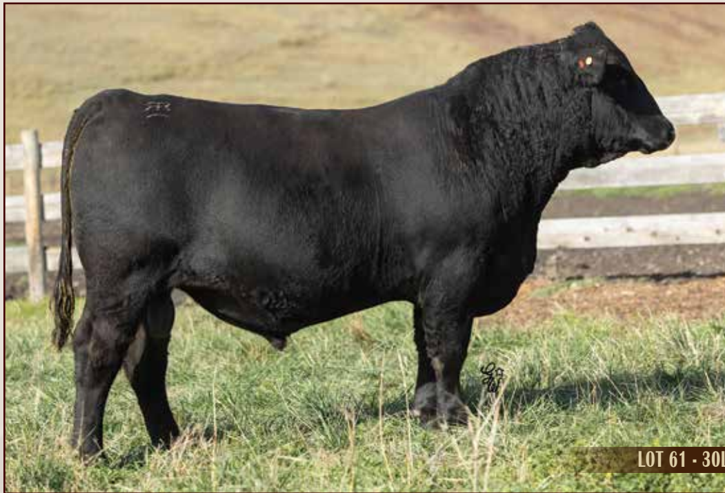
LOT 61 - 30L