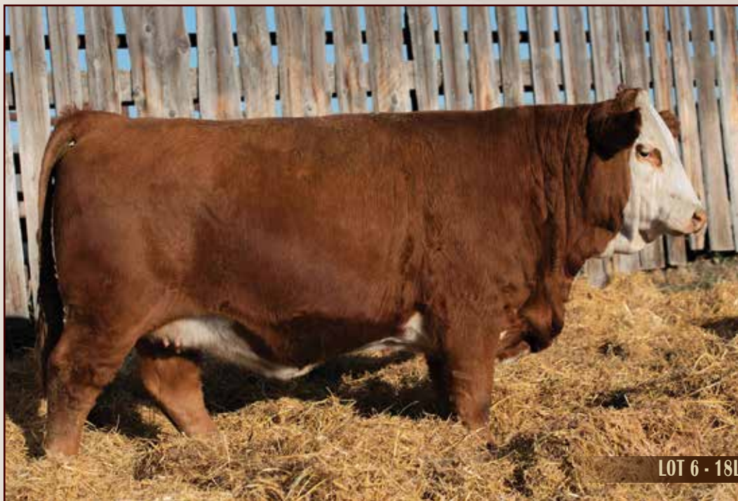
LOT 6 - 18L

MF MR. EVAN 14P CROSSROAD PANDITA 308P EAGLE-RIDGE UNITY 30U EAGLE-RIDGE SIERRA 32S BLACK GOLD CRUDE JKL MISS CASSIDY 21C CARLOS 27C OKOFLECK SELENA 4S