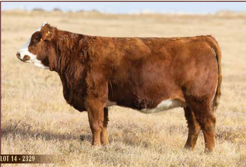
LOT 14 - 2329