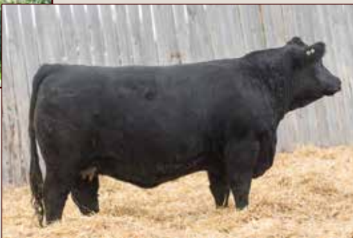
BEE CHELSEA 102J - Dam of Lot 27