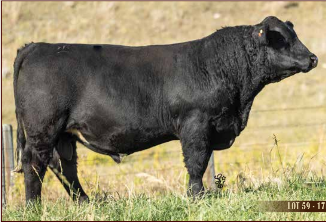
LOT 59 - 17L