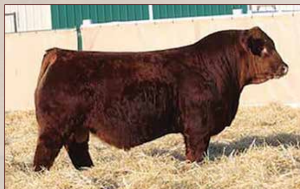
WHEATLAND NEXT CENTURY 43H - Sire of Lots 54 and 57