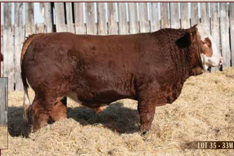
LOT 35 - 33M