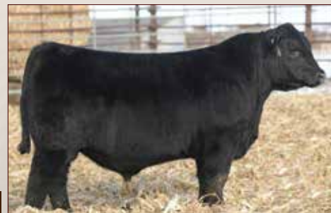
POSS RAWHIDE - Sire of Lot 76