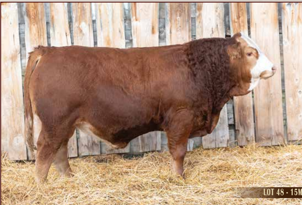
LOT 48 - 15M

SOUTHSEVEN MR ADONIS 96Z MTV AMY 4G MI MS BLAIR 19B