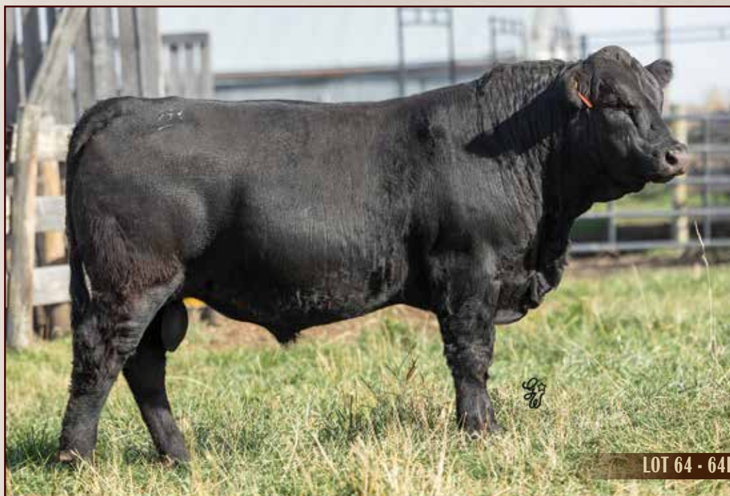
LOT 64 - 64L

TRIPLE C SINGLETARY S3H CCR MS 4045 TIME 7322T CLRS GRADE-A 875 A WS ANISE A71 DIKEMANS SURE BET NATASHA 10N HOOKS SHEAR FORCE 38K R&R MILKMAID 76N