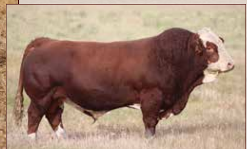
JNR'S TITANIUM - Sire of Lot 18

Observed bred to MTV Maurey 5L on april 24th. Ultrasound safe to breeding on June 9th. Exposed to MTV Maurey 5L from April 15th-June 15th.