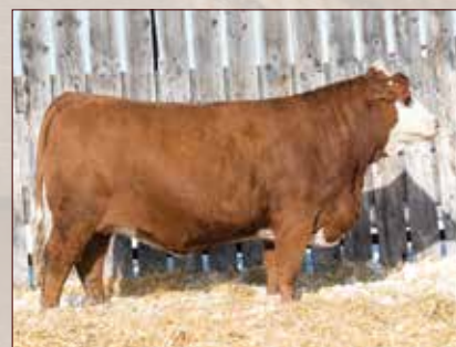
JKL MISS JENNIFER 34J - Maternal Sister of Lot 2