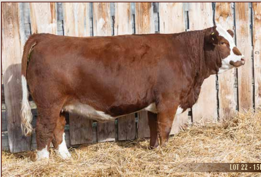
LOT 22 - 15L

CROSSROAD TUXEDO 222T ANCHOR "T" BARBI 46K SHAWACRES JAHARI 50L MTV BELLE 1J