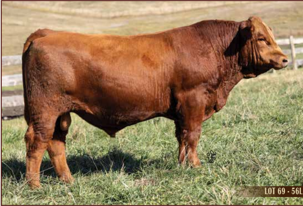
LOT 69 - 56L