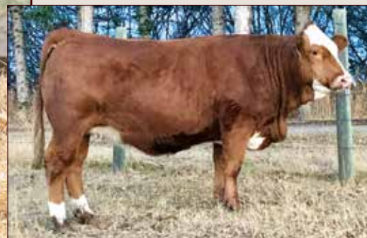
JB CDN FATIMA 1952 - Dam of Lot 43