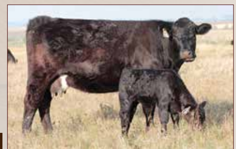
R AND R MILKMAID SMTR 12F - Dam of Lot 66