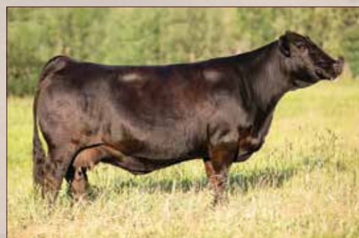
JR BROOKE - Dam of Lots 51 and 52

CE 9.6 BW 2.3 WW 88.8 YW 134.1 M 23.0 MCE 5.1 MWW 67.4