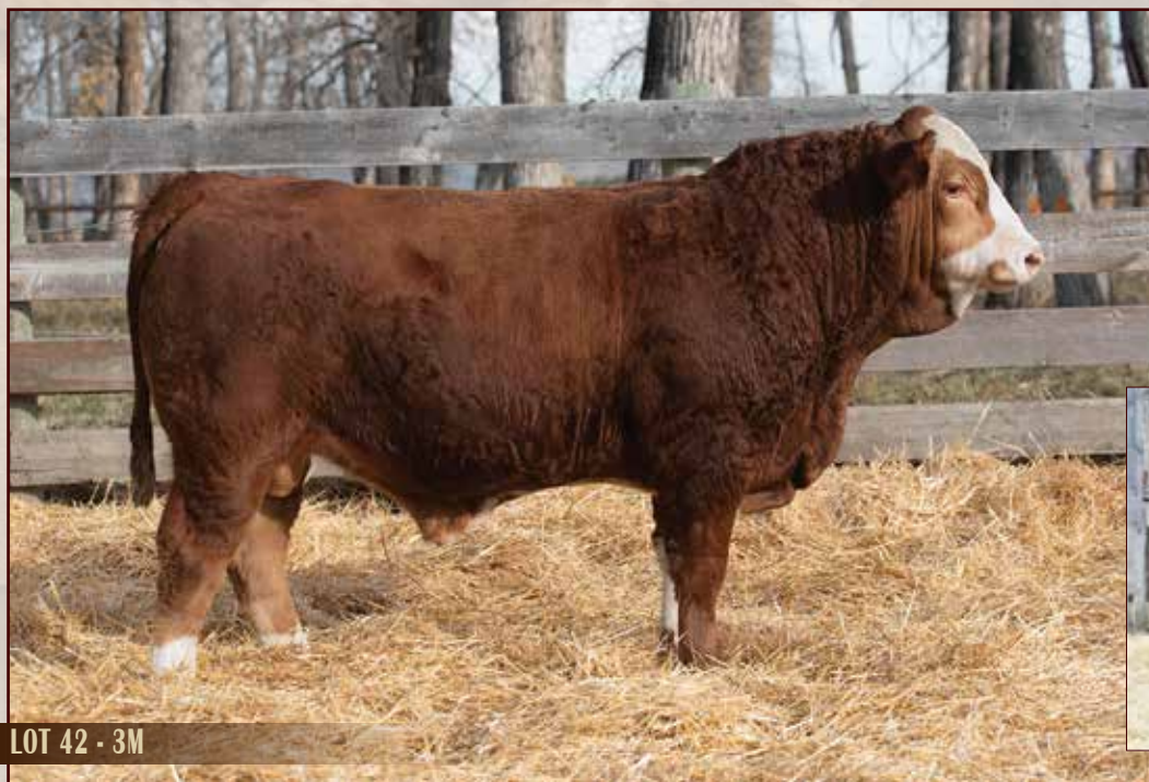
LOT 42 - 3M