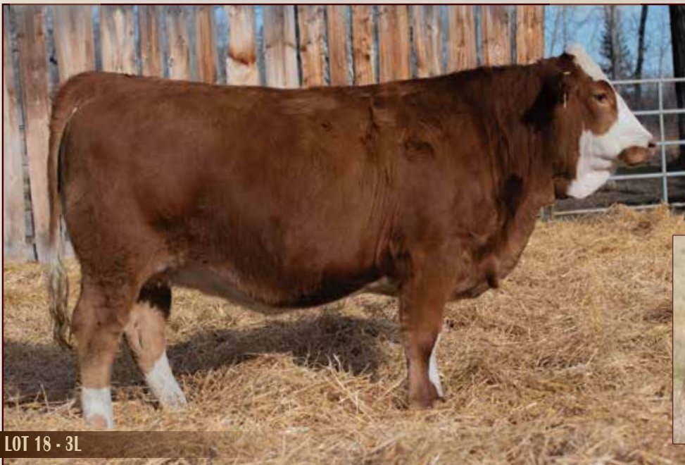
LOT 18 - 3L

MVS DUCATI MVS CAROLINE 8J MVS EYEMAX 3D