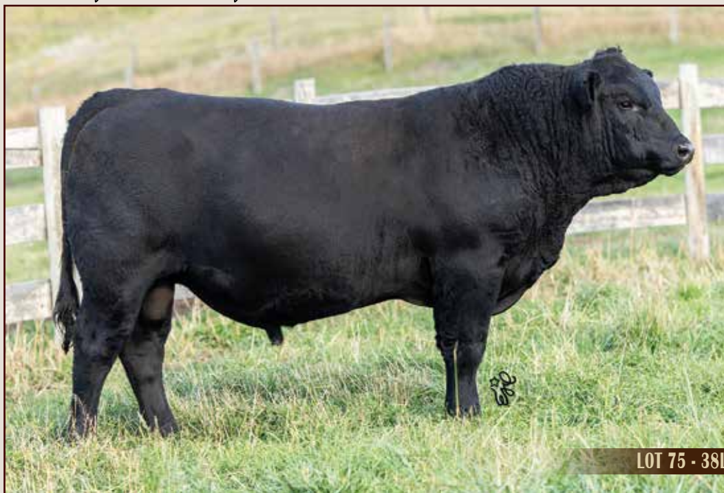
LOT 75 - 38L