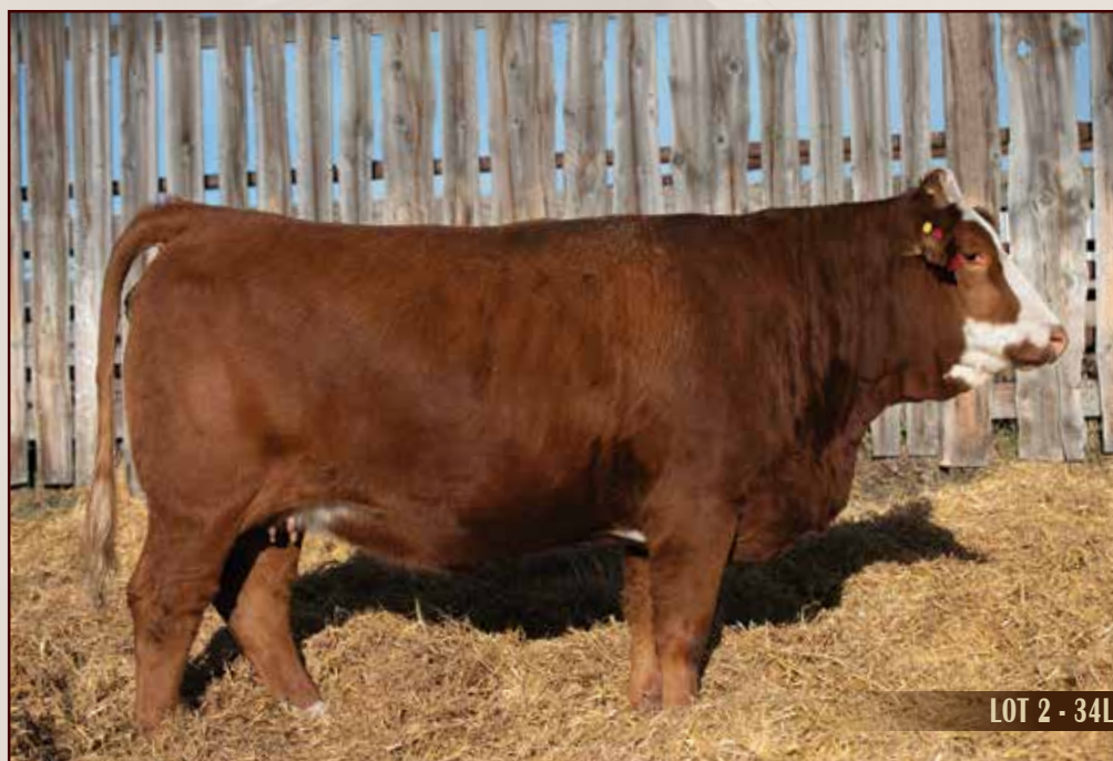
LOT 2 - 34L