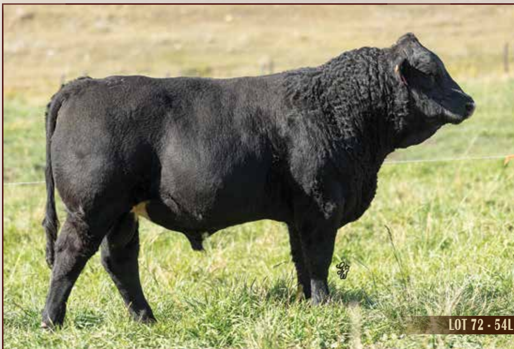
LOT 72 - 54L