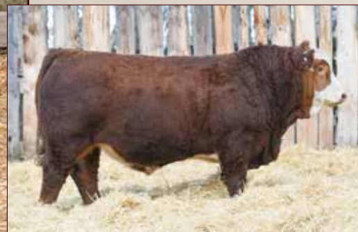
MTV KARLSBURG 3J - Sire of Lots 41 - 44