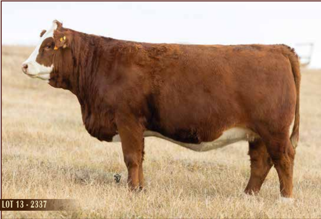
LOT 13 - 2337