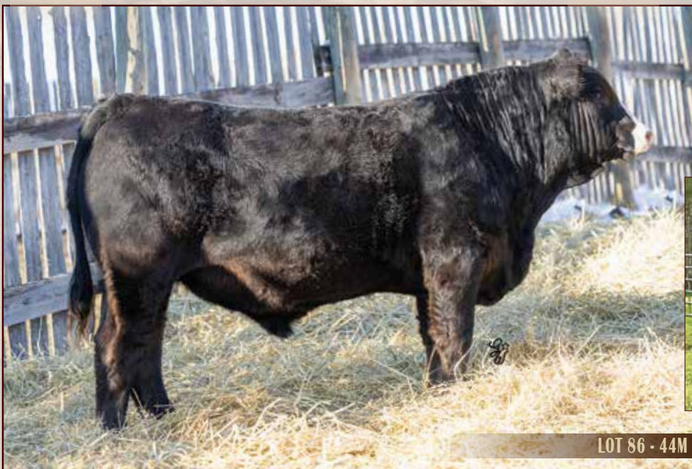
LOT 86 - 44M

This black blaze faced bull is very well put together and thick throughout. He was our heaviest at weaning and his dam Rendezvous Shamwow 44A always weans the good ones! He will also be the last bull calf out of our late herd sire MTV 6B.