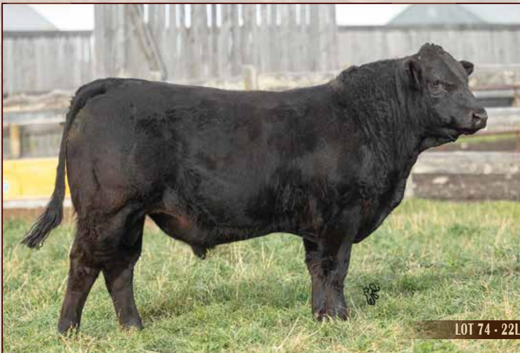
LOT 74 - 22L