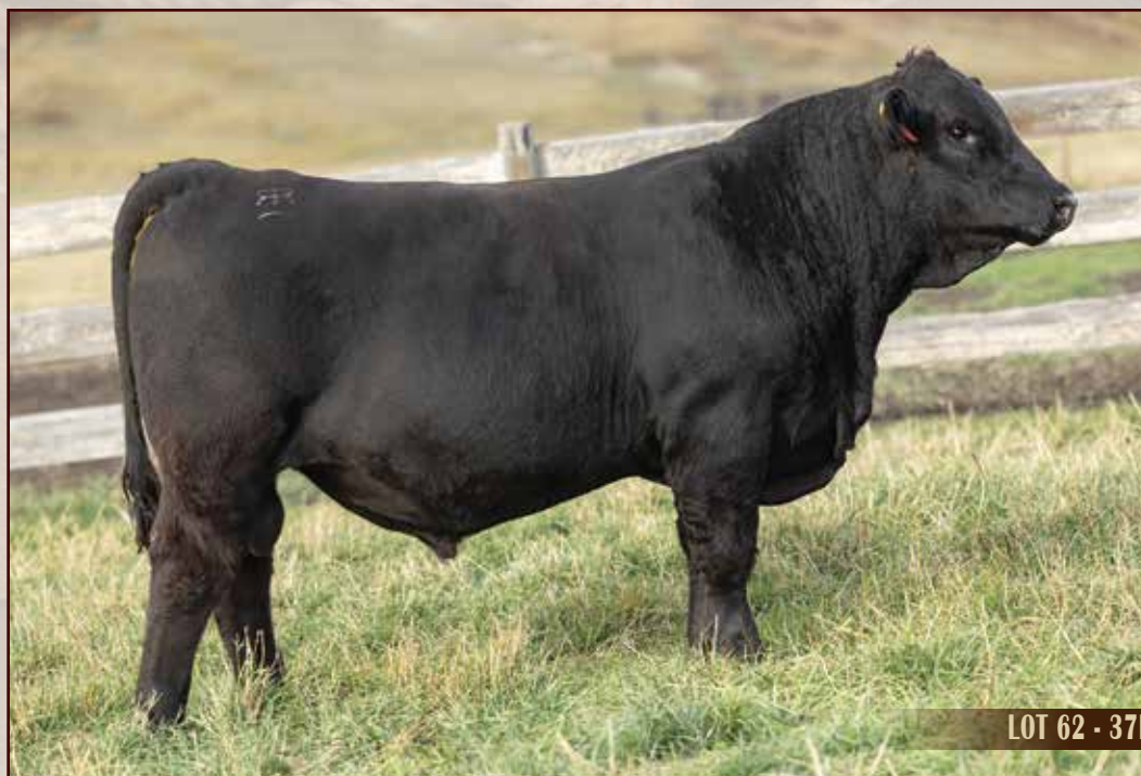
LOT 62 - 37L

TRIPLE C SINGLETARY S3H CCR MS 4045 TIME 7322T GW LUCKY MAN 644N R&R MISS KEYSTONE 59N