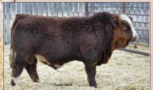
VIRGINIA DIRTY-HANDS 723J Sire of Lots 28, 29, 34 and 36

Moses is a Sibelle Pol Synergy 18F son out of a Battle Cry 282B dam. He is dark red with large goggles, a thick butt and a flat top. Actual WW (31 Aug 2024) 810 pounds WWADJ 745 pounds.