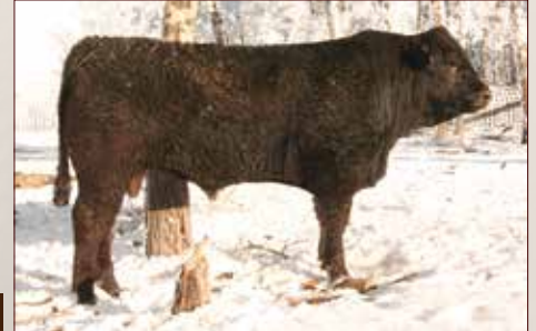
R & R BEEFMAKER 32A - Sire of Lot 73