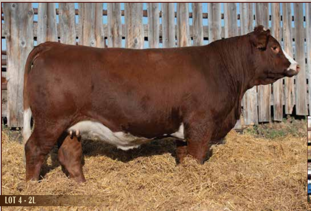
LOT 4 - 2L

SUNNY VALLEY SARGENT 24S BHR LISMAR R029 CAJUN NEFF DIAMOND T 273U MONA LISA VIRGINIA PRECISION 16C ANCHOR D KAEL 255C STARWEST EVIDENCE MI MS DASHA 56D