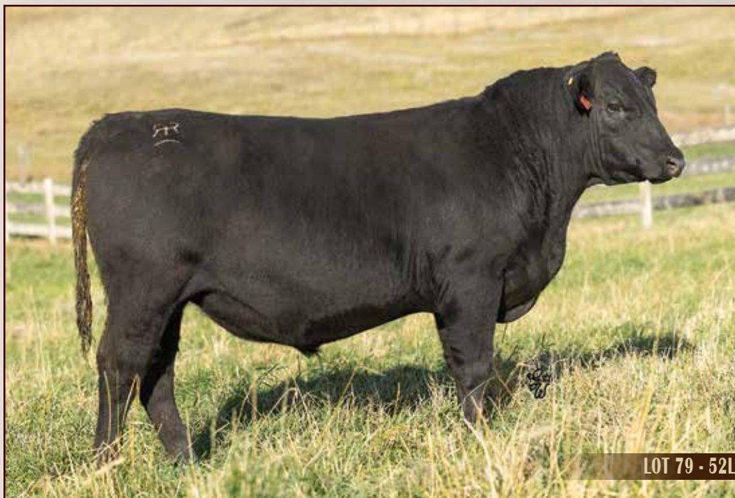
LOT 79 - 52L