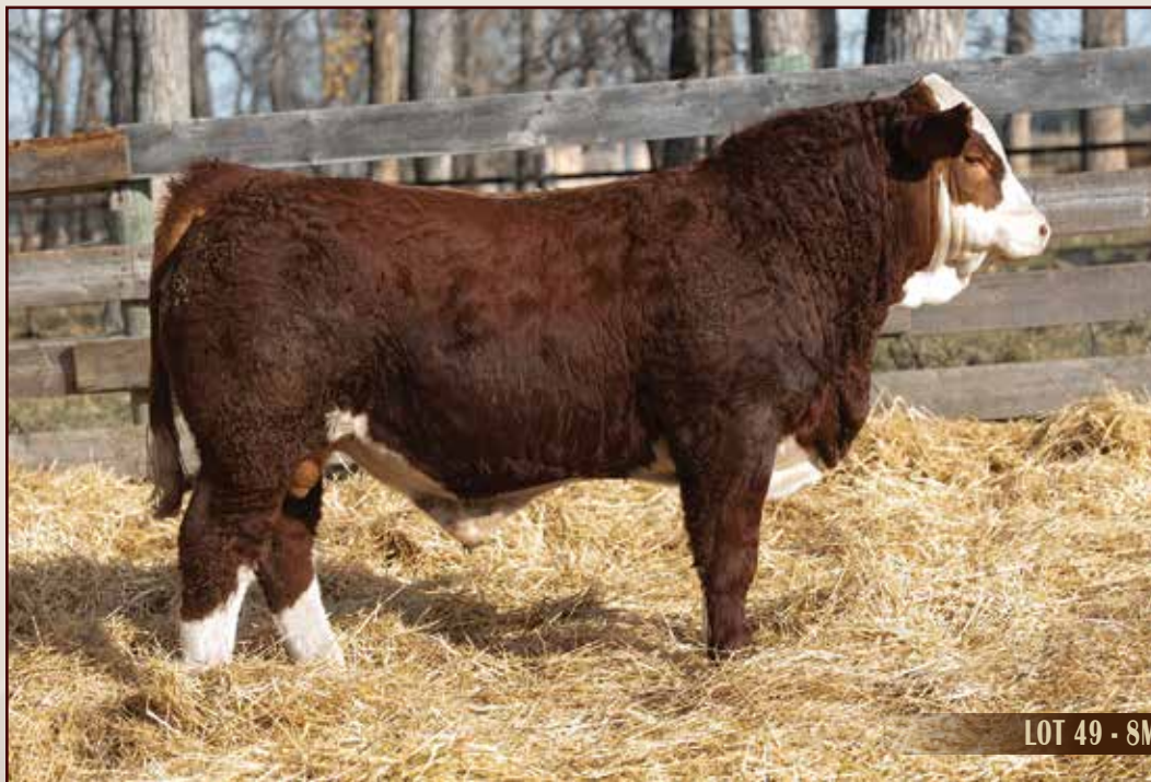
LOT 49 - 8M