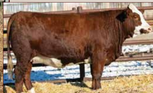
MAVV JEWEL 40J - Dam of Lot 4

Estimated pregnant to the March 27, 2024 breeding date.