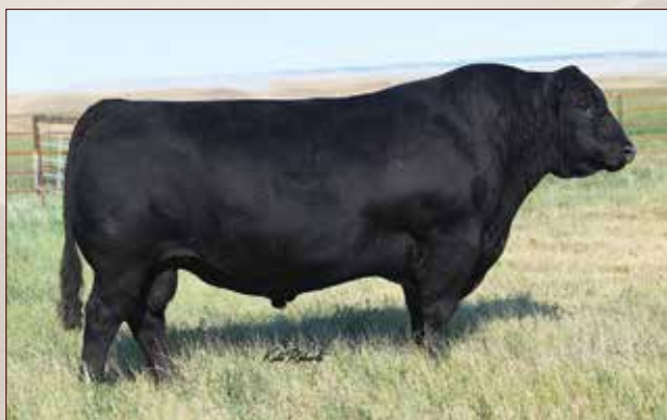
SYDGEN ENHANCE - Sire of Lot 75

R&R BEEFMAKER 15Y R & R MILKMAID 85P HUNT MR JOCK 44J R & R MILKMAID 90P