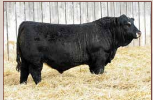
IPU 116G TOP TIER 26J - Sire of Lots 26 and 27