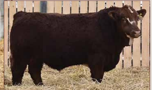
CROSSROAD PILOT 21H - Service Sire of Lots 19, 20 and 22

AI'd to the homo polled CrossRoad Pilot 21H on April 6th. Ultrasound safe to AI on June 9th. Exposed to MTV Maurey 5L April 15th- June 15th.