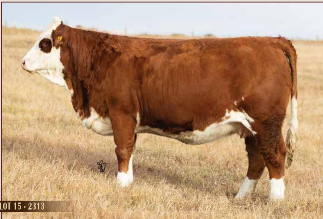
LOT 15 - 2313