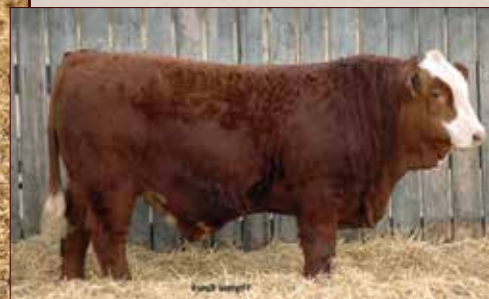
VIRGINIA BREEZER 21F - Sire of Lots 2, 3 and 10

AI bred to BEE Battle Cry 282B (#1135464) on March 27, 2024. Exposed to MJB Lucas 24L (#1440767) April 14 - June 1, 2024. Pregnant to AI date.