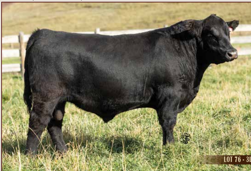
LOT 76 - 3L