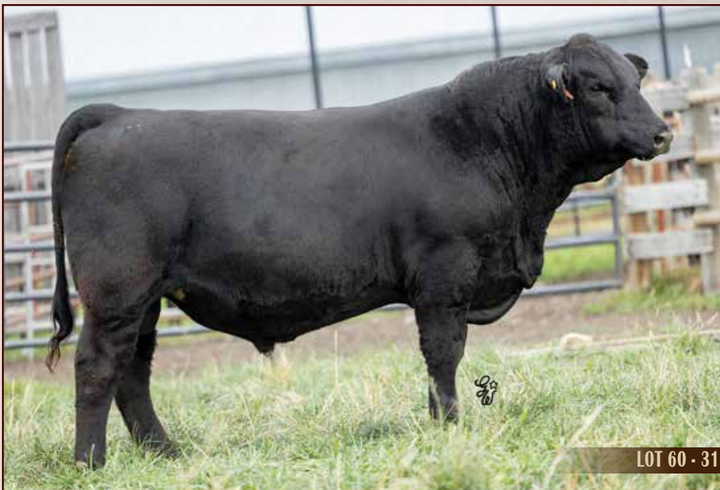
LOT 60 - 31L

TRIPLE C SINGLETARY S3H CCR MS 4045 TIME 7322T TRIPLE C SINGLETARY S3H R & R MILKMAID 53P