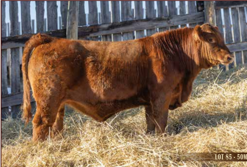
LOT 85 - 50M

This deep bodied solid red bull has heifer bull written all over him! He is 2 months younger than the other bull in our offering but we feel that he has too much potential, so we just had to bring him.