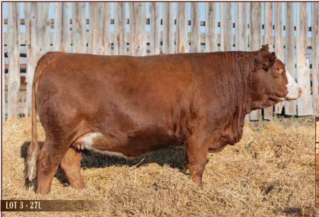
LOT 3 - 27L