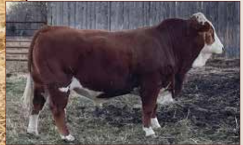
MTV MAUREY 5L - Exposure sire of Lots 17 - 22

Ultrasound tested June 9 safe to May 5 breeding.