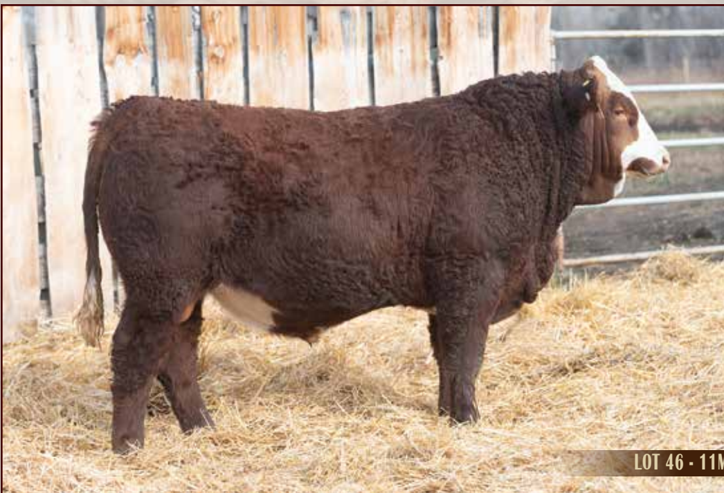
LOT 46 - 11M

CROSSROAD TUXEDO 222T ANCHOR "T" BARBI 46K SHAWACRES JAHARI 50L MTV BELLE 1J