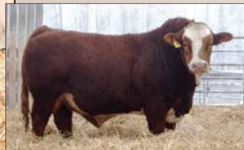
ANCHOR D OUTLOOK - Sire of Lots 49 and 50