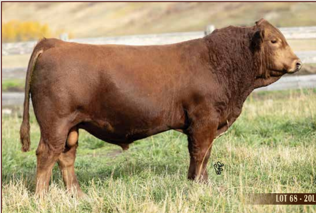
LOT 68 - 20L

NICHOLS LEGACY G151 C&D TRACY R PLUS RED RIBEYE 1134L DCR MISS ZINGER WS ALL-AROUND Z35 WS LITTLE SISTER W37 RED BROWN JYJ REDEMPTION Y1334 R&R MILKMAID 4B