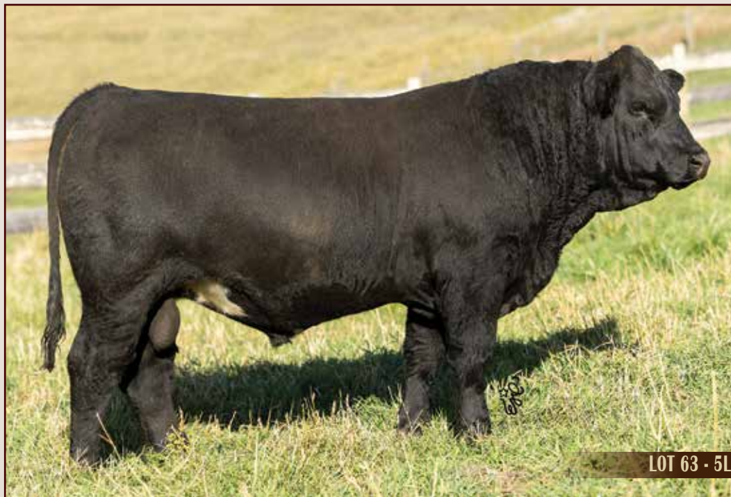
LOT 63 - 5L