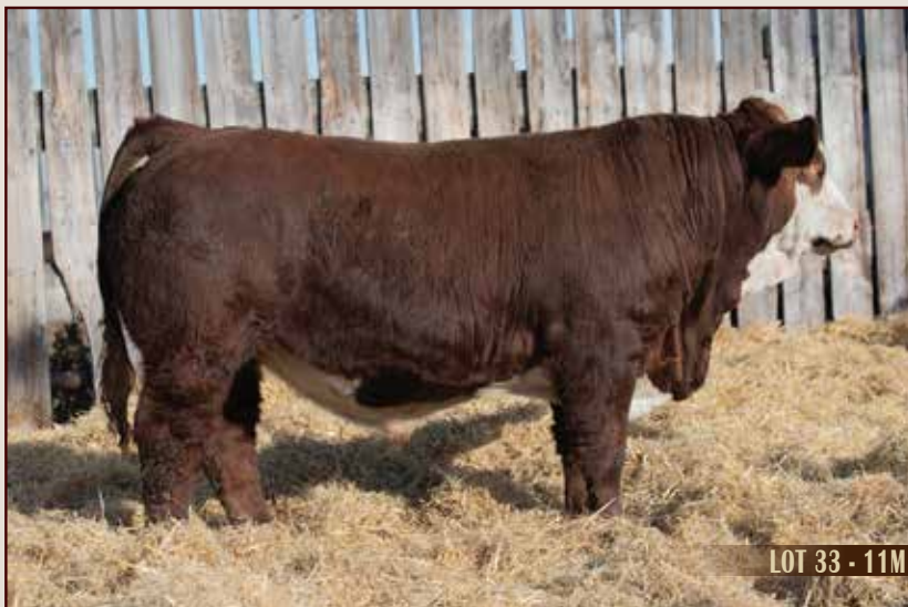
LOT 33 - 11M

Mastermind is a Full Tilt son out of a BEE Battle Cry 282B daughter. He is dark red with small goggles, a good butt and good feet and legs. Actual WW (31 Aug 2024) 810 pounds. WWADJ 719 pounds.