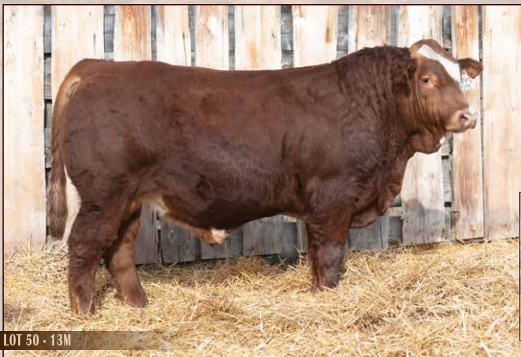
LOT 50 - 13M