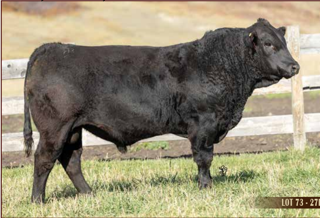
LOT 73 - 27L