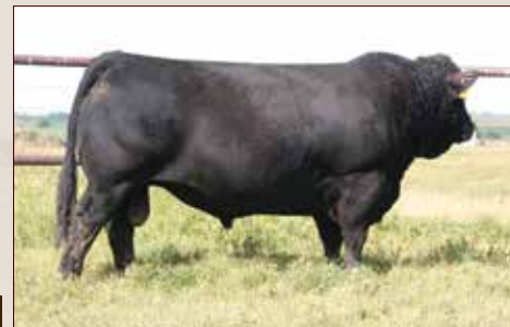
DIKEMANS DOUBLE DOWN 26W - Sire of Lot 71