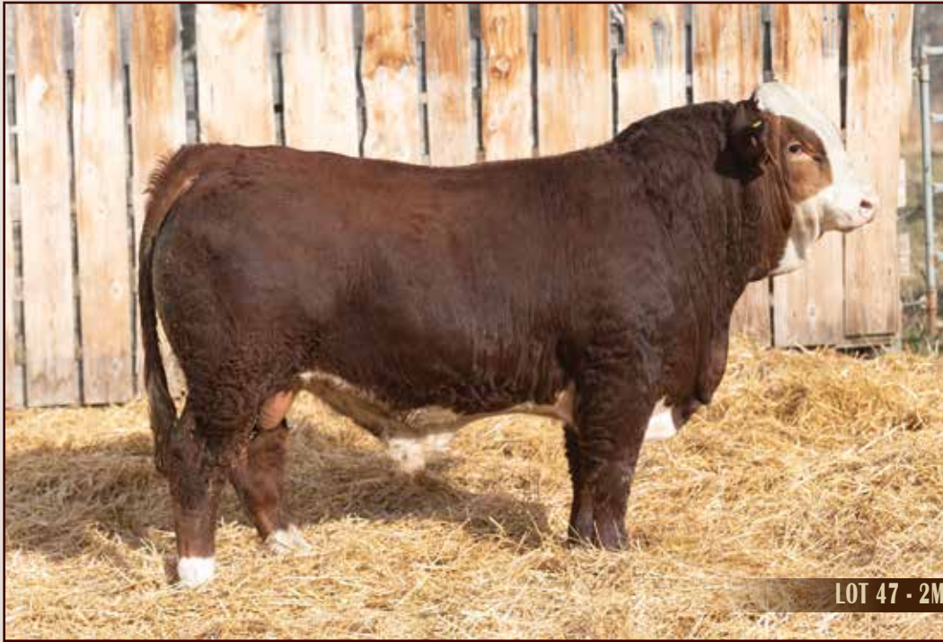
LOT 47 - 2M