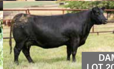
DAM OF LOT 207 & 208

A.I. APRIL 12 TO GREENWOOD FOUR MILE 47J. EXPOSED APRIL 15 TO JUNE 20 TO U2Q GUARANTEE 3536L. SAFE TO A.I. DATE. DUE JAN 19.